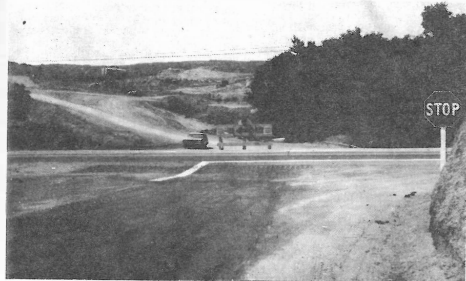
Freeway progress on Tavern Road Interchange is shown in this photo looking north where Tavern will cross Hwy 80, go over bridge, shown in air shot on Page 5, and turn west to serve areas nearby. At corner on left will soon be built large new Mobil Gas station, now being surveyed, see photo on Page 3.